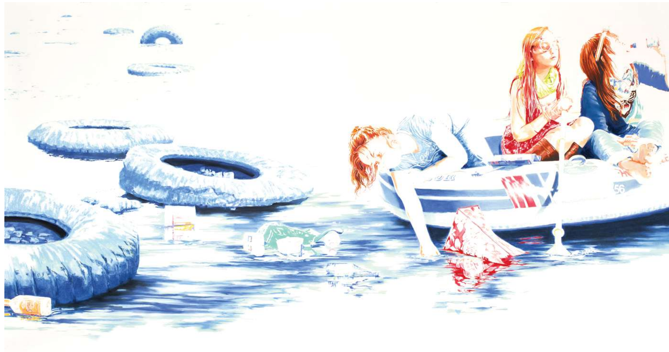
dateline: (07-08) 07:13 CST Winona, MN. pastel and conte on paper 50 x 87 inches