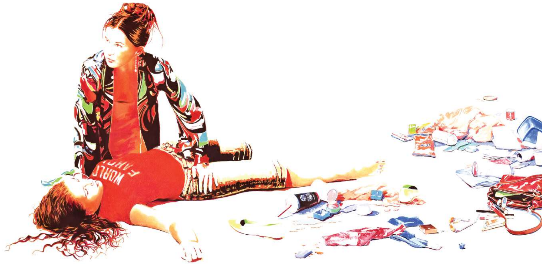
dateline: (10-21) 22:42 EST Fremont, OH. (AP)-- pastel and conte on paper 50 x 78 inches