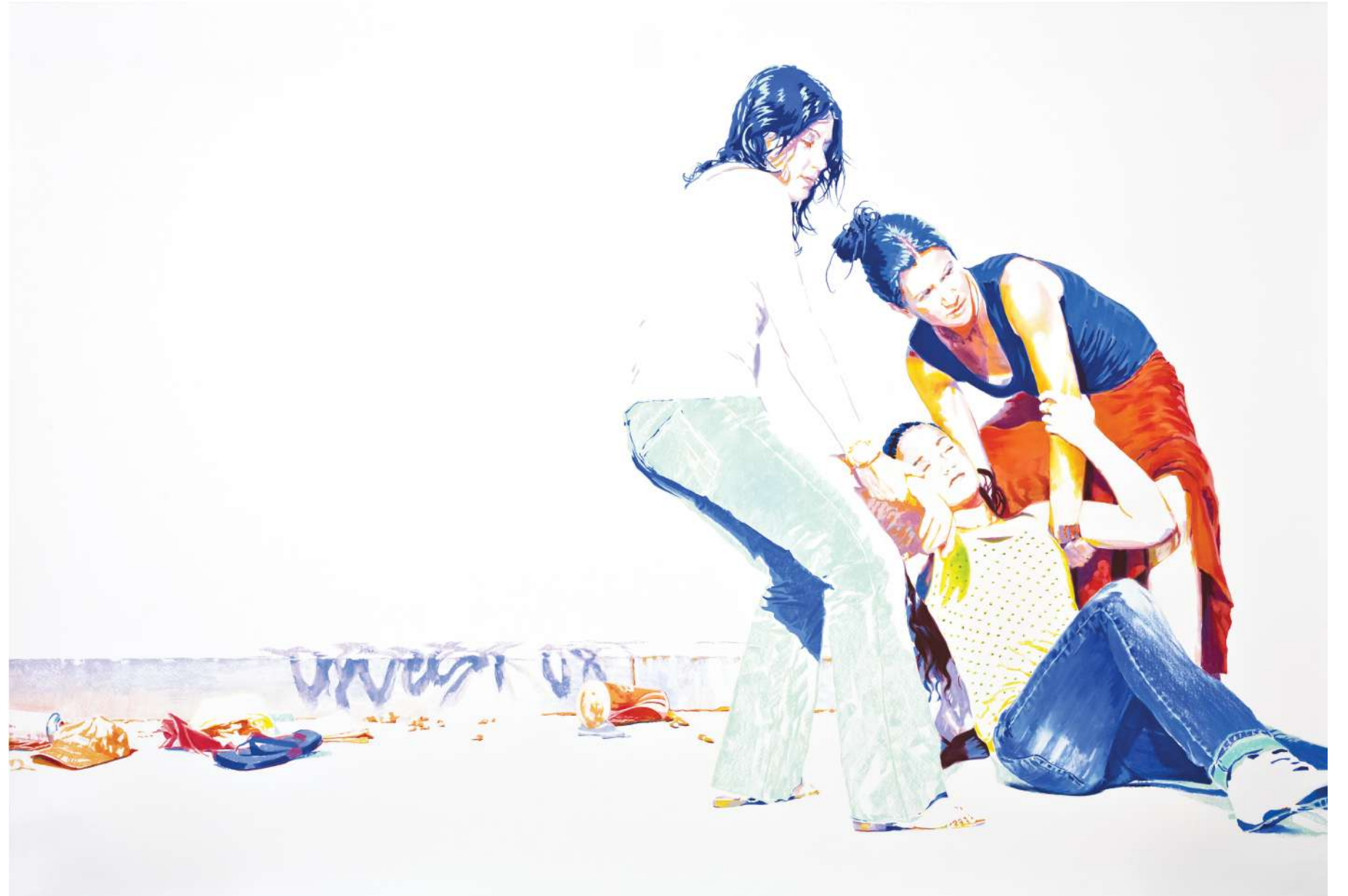
dateline: (06-08) 17:17 EST Waltham, MA. -- pastel and conte on paper 50 x 78 inches