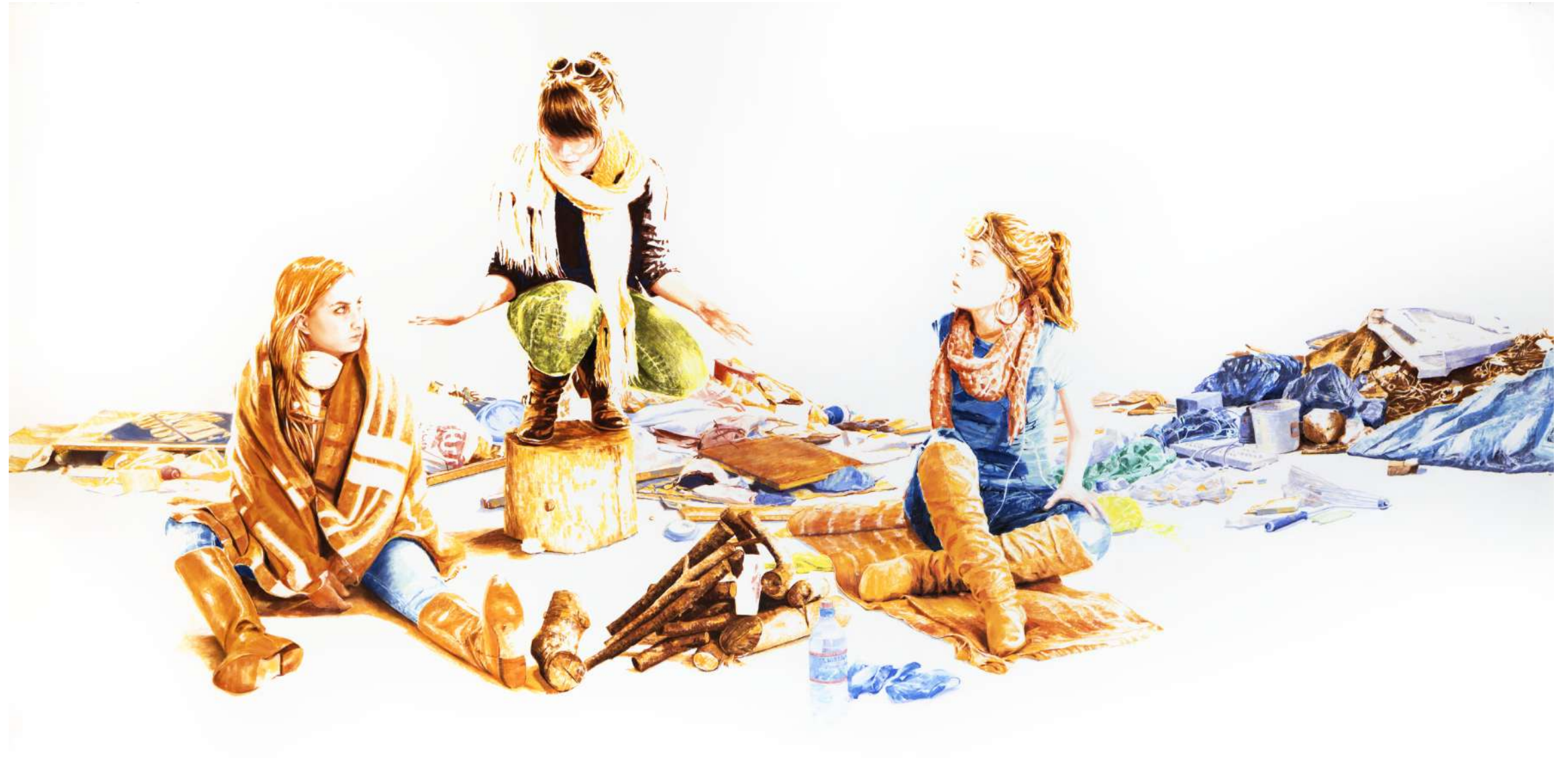
dateline: (08-07) 10:08 PDT Trona, CA — pastel and conte on paper 50 x 90 inches