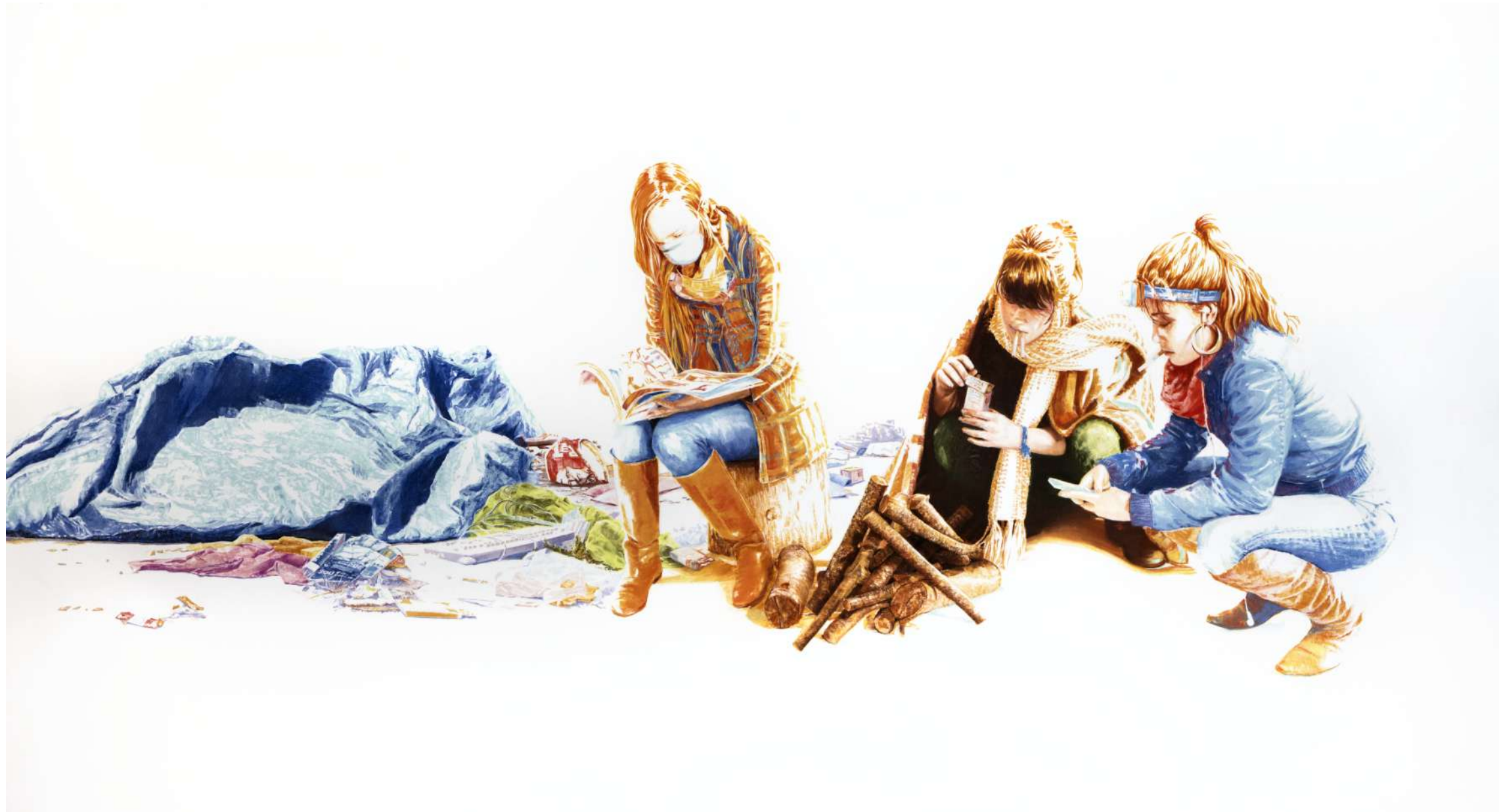
dateline: (08-07) 16:22 PDT Trona, CA (AP)— pastel and conte on paper 50 x 90 inches