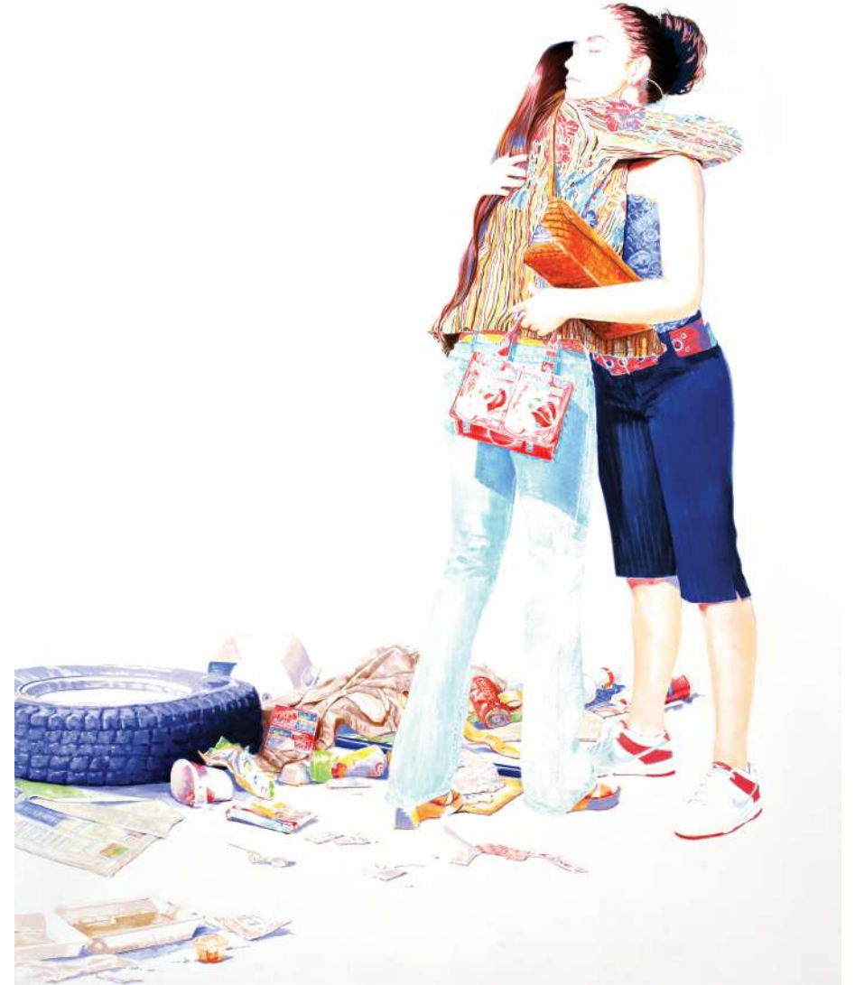
dateline: (09-14) 04:28 MST Benson, AZ. (AP)-- pastel and conte on paper 72 x 50 inches